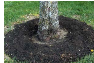
Correct placement of mulch